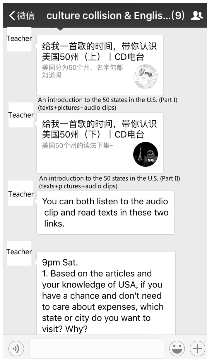
Figure 1. Distribution of materials (in Chinese) and initiation of discussion questions