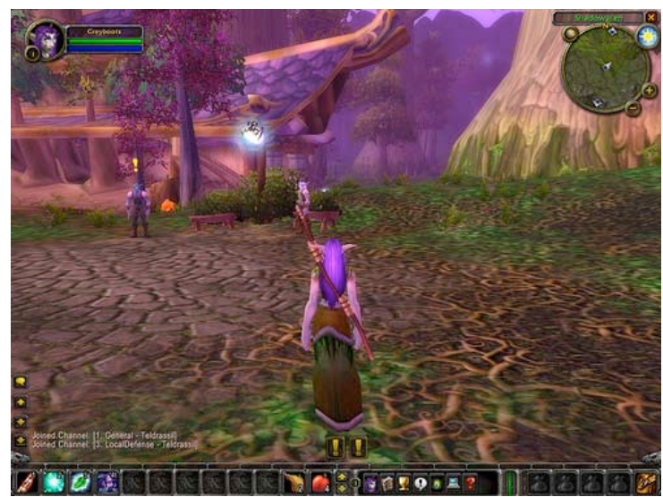
World of Warcraft: http://www.worldofwarcraft.com