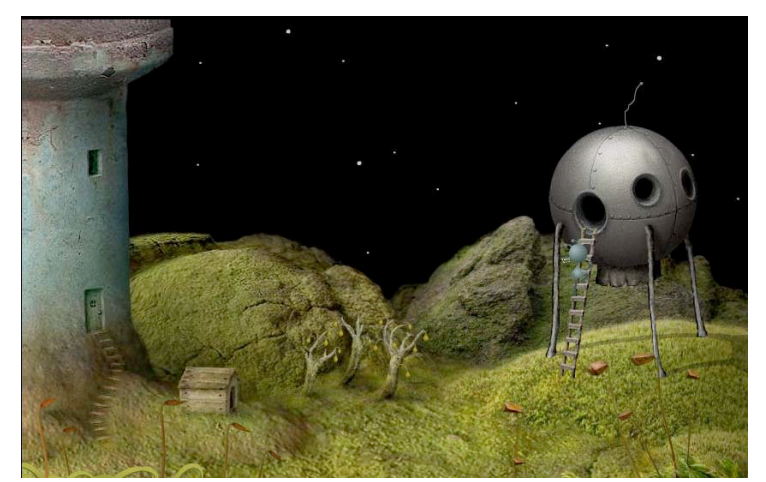
Samorost 2: http://www.samorost.net/samorost2/