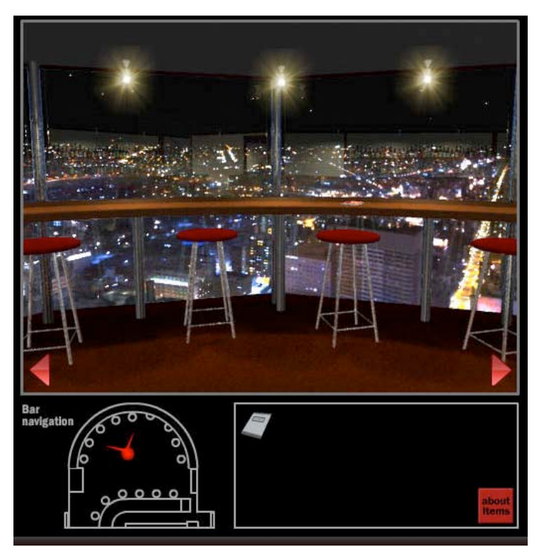
Escape From the Bar: http://www.gotmail.jp/apps/bar_e.html