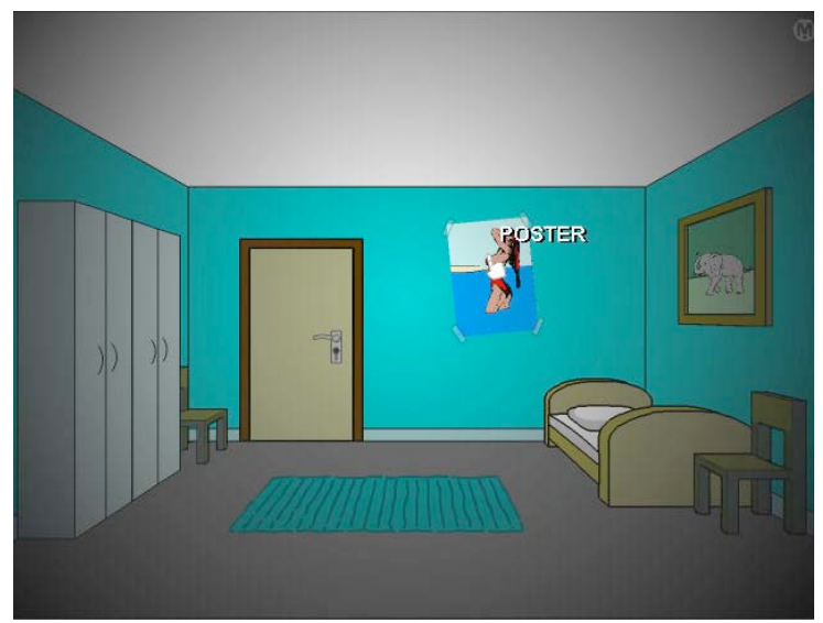
MOTAS (Mystery of Time and Space): http://www.albartus.com/motas/